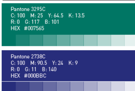
Figure No. 3-2