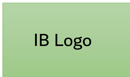
Figure No. 10-2