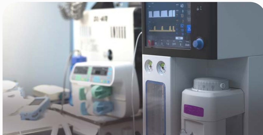
Anesthesia and emergency intervention devices