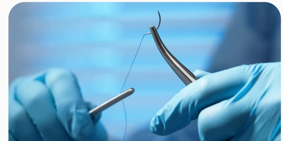
Wound and skin care