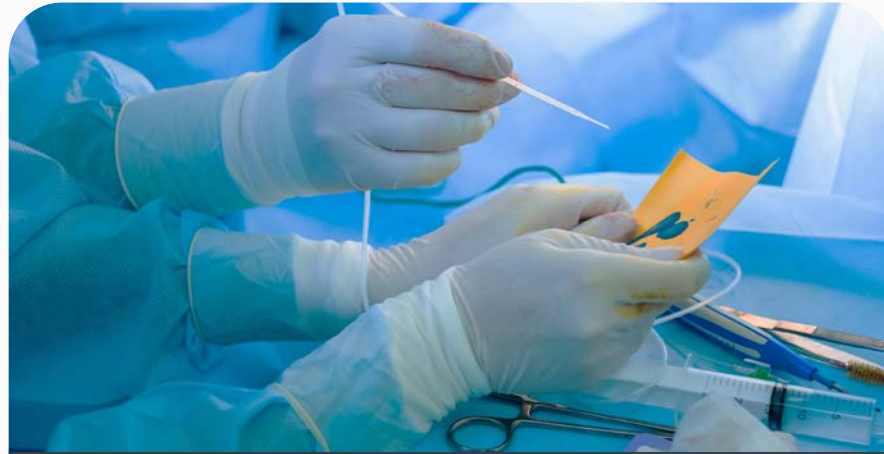
Non-active, soft tissue implanted devices