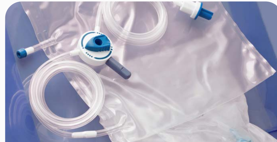
Infusion and transfusion